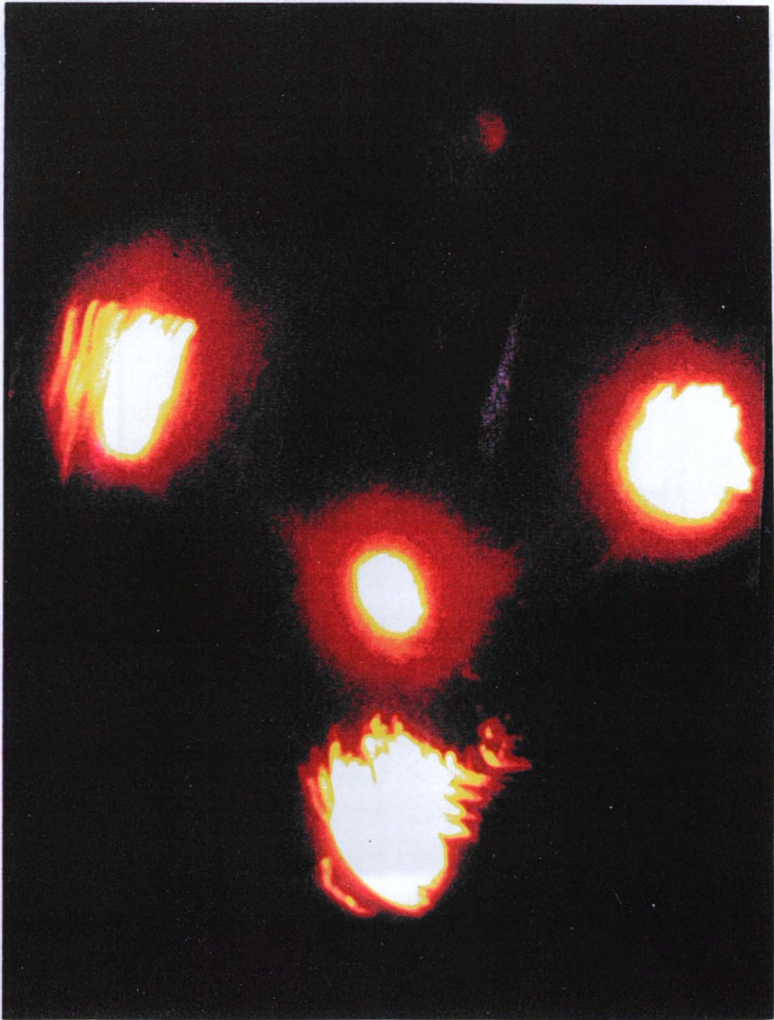
AN EXAMPLE UAP FORMATION OF THE TRIANGULAR TYPE