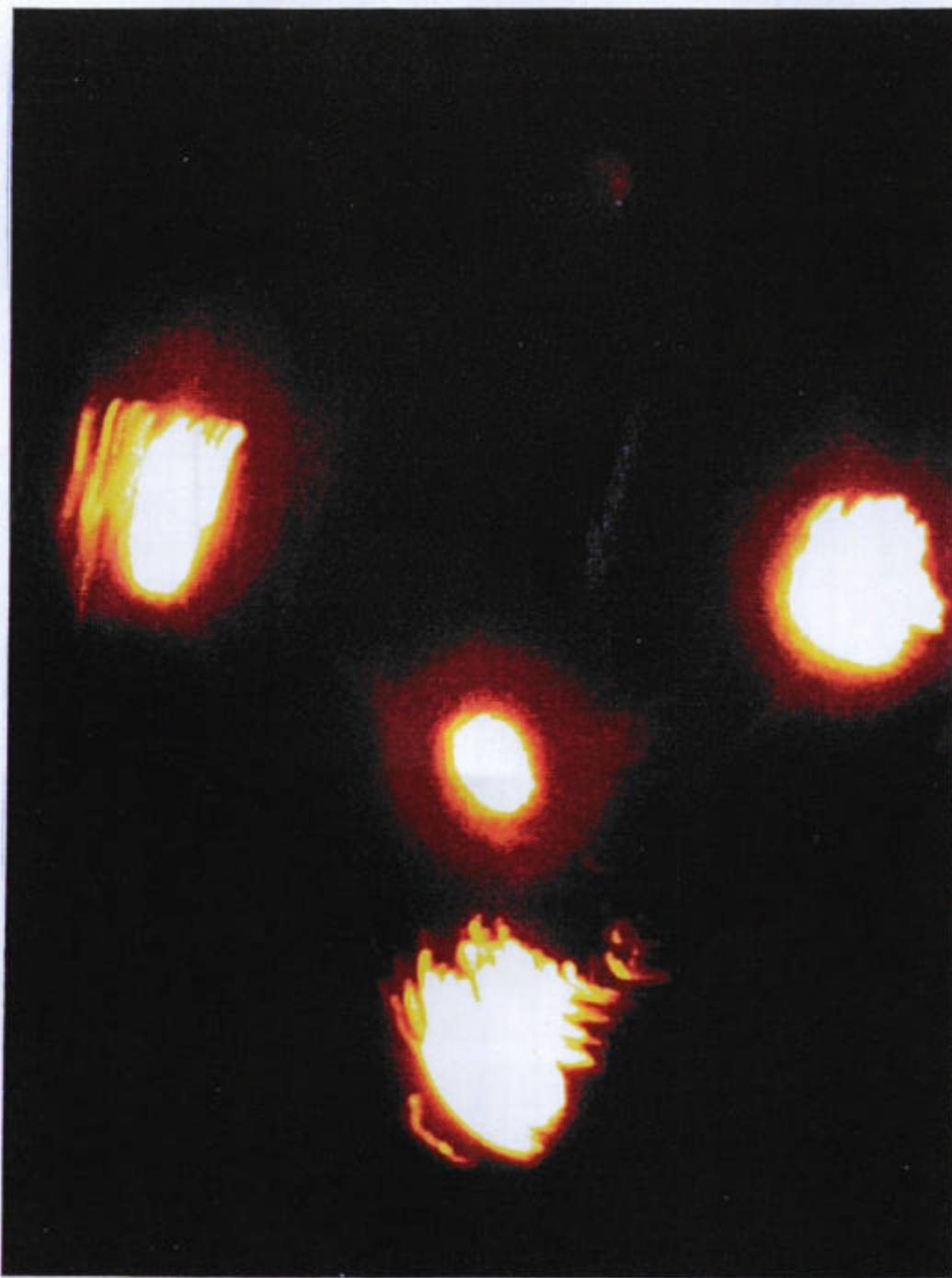
AN EXAMPLE UAP FORMATION OF THE TRIANGULAR TYPE