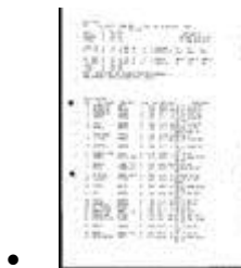
Flight 11 1/3