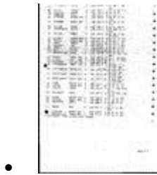
Flight 77 2/2