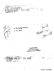
Flight 175 1/2