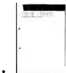
Flight 11 3/3