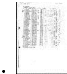
Flight 93 1/1