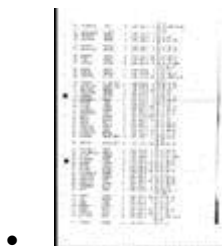
Flight 11 2/3