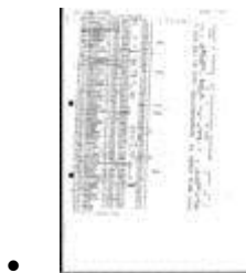
Flight 175 1/1