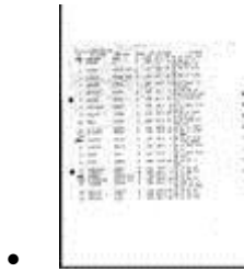
Flight 77 1/2