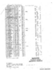
Flight 93 1/1