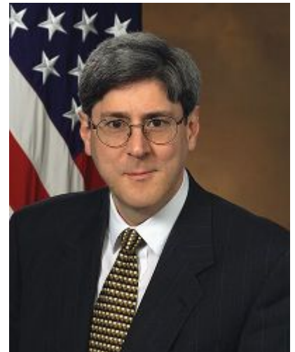
Douglas Feith, Under Secretary of Defense for Policy on 9/11