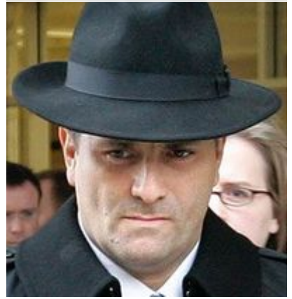
Jack Abramoff, Deep state operative

insider having been on the Transition Advisory Team assigned to the Department of the Interior in 2001. Abramoff is a lobbyist who is a central figure in a plethora of political scandals, fraud, and other scams. He was sentenced to five years in prison term for fraud, conspiracy, and tax evasion. He also had foreknowledge of the War In Iraq.