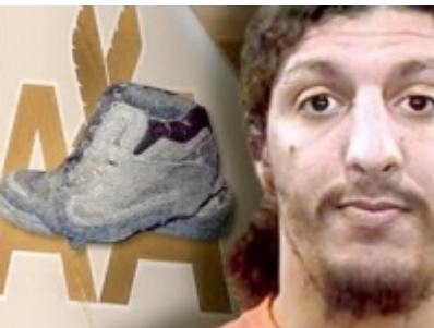
Richard Reid, the "Shoe-bomber".