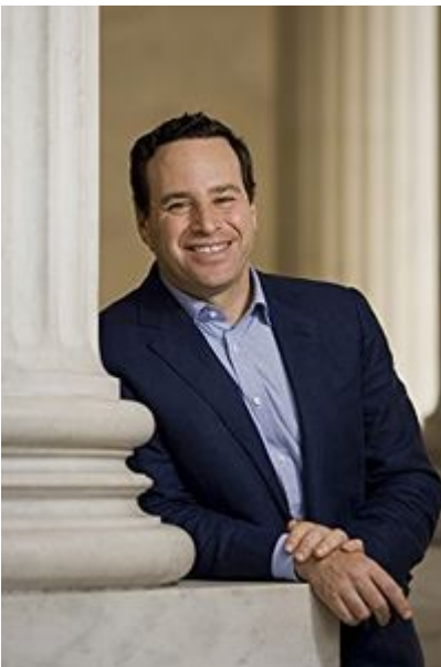
David Frum, Bilderberg Steering committee member and speech writer for George W. Bush

On 20 September, 2001, in his address to the Joint Session of Congress following the 9/11 attacks, Bush grossly inflated the number of Israeli casualties in the attacks from 5 to 130.