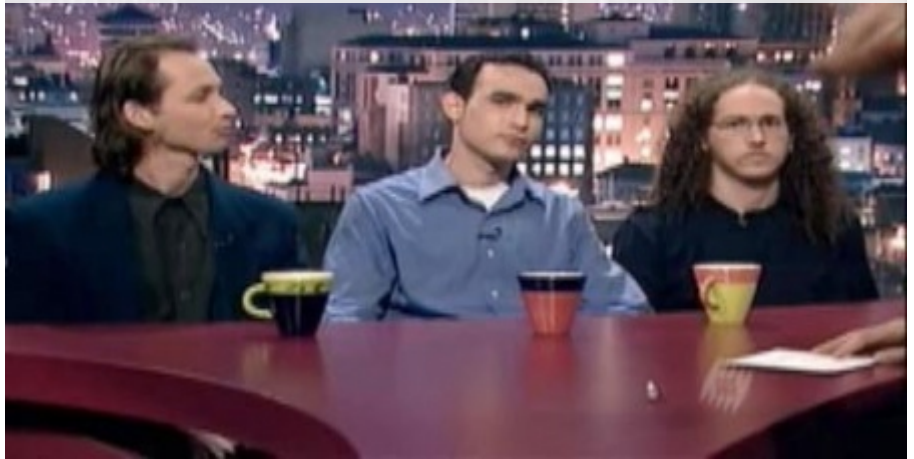
3 of the 5 "Dancing Israelis" on Israeli TV

a New Jersey local paper, The Bergen Record , that bomb sniffing dogs were brought to the van and that they reacted as if they had smelled explosives. According to the Jewish Daily Forward the FBI later determined that at least two of the Israelis were Mossad agents and that their employer, Urban Moving Systems was a Mossad front. [22]