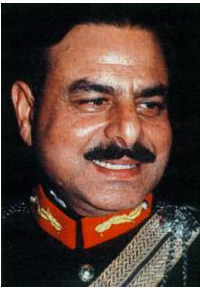
General Hamid Gul