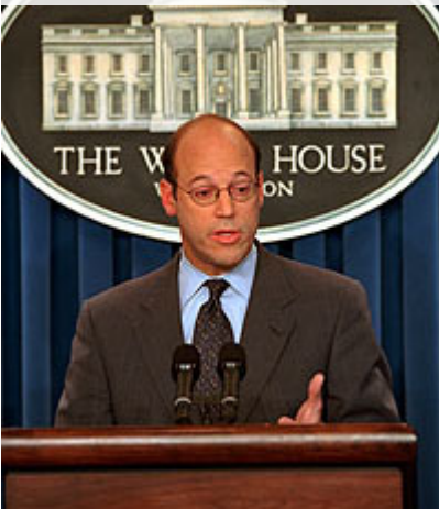
Ari Fleischer, White House Press Secretary on 9/11

By using the Wikispooks.com servers, you agree to its use of cookies More information OK