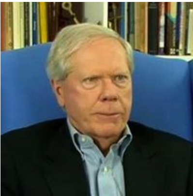
Paul Craig Roberts

Paul Craig Roberts , a former Assistant Secretary of the Treasury for Economic Policy and associate editor of the Wall Street Journal supports the theory of Israeli involvement. He maintains that the operation had the backing of key members of the US government such as Dick Cheney . [38]