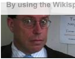
Philip Zelikow, 9/11 Commission Executive Director

Zelikow was appointed the executive director of the 9/11 commission - the most powerful position of the committee. This Zionist Jew is responsible for concocting the contrived fiction that was presented as the 9/11 Commission Report - official narrative. The report contains hundreds of glaring anomalies, contradictions, omissions and downright falsehoods. It even manages to omit any reference at all to the collapse of Building 7 at 5:20 pm.