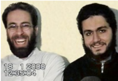
A still image from "laughing hijackers" video showing Ziad Jarrah(left), and Mohammed Atta(right), allegedly making their martyrdom video just before 9/11.

One possible translation of "Al-Qaeda" is "The Base", but it also translates as "The Toilet." The Arabic word 'Qa'ada' means 'to sit' (on the toilet bowl). Arab homes have three kinds of toilets: 'Hamam Franji' or 'Al-Qaeda' or foreign toilet, "Hamam Arabi" or Arab toilet, and a potty used for children called 'Ma Qa'adia' or 'Little Qaeda.' 'Ana raicha Al Qaeda' is a colloquial expression for "I'm going to the toilet," so this seems like an unlikely choice of name for such a group.