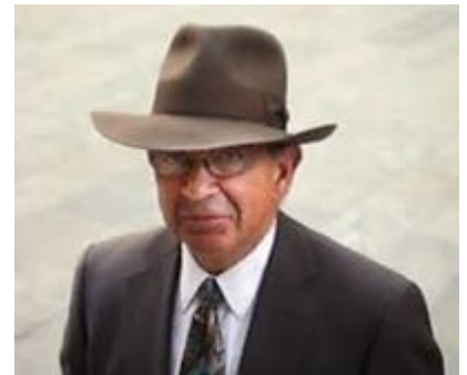
Judge Alvin Hellerstein, involved in several pieces of 9-11/Legal action

All the judges appointed were Zionist Jews: