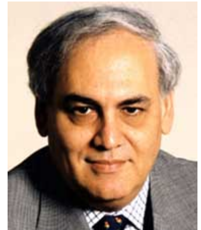
Richard Perle, Chairman of the Defense Policy Board Advisory Committee on 9/11