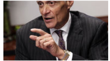
Michael Chertoff, Assistant Attorney General for the Criminal Division on 9/11