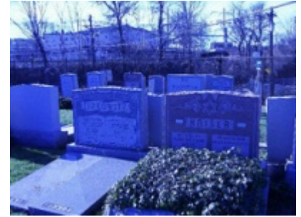
Gomel Chesed Cemetery

In October 2000, approximately 11 months before 9/11, a retired Israeli Defense Forces (IDF) officer, [Who?] and veteran of the Yom Kippur War (1973), was collecting English Ivy Cuttings at the Gomel Chesed Cemetery located at McClellan and 245 Mount Olive Avenue, which is near the city lines of Elizabeth and Newark, New Jersey. The Gomel Chesed Cemetery is a Jewish cemetery.