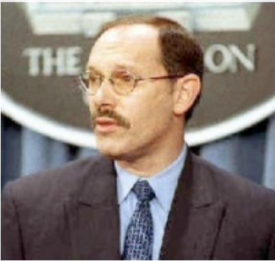
Rabbi Dov Zakheim, Under Secretary of Defense (Comptroller) on 9/11

By using the Wikispooks.com servers, you agree to its use of cookies More information OK