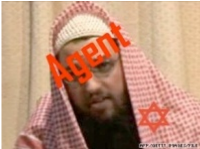
Adam Yahiyeh Gadahn

One possible translation of "Al-Qaeda" is "The Base", but it also translates as "The Toilet." The Arabic word 'Qa'ada' means 'to sit' (on the toilet bowl). Arab homes have three kinds of toilets: 'Hamam Franji' or 'Al-Qaeda' or foreign toilet, "Hamam Arabi" or Arab toilet, and a potty used for children called 'Ma Qa'adia' or 'Little Qaeda.' 'Ana raicha Al Qaeda' is a colloquial expression for "I'm going to the toilet," so this seems like an unlikely choice of name for such a group.