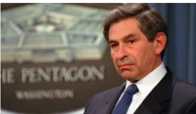
Paul Wolfowitz, Deputy Defense Secretary on 9/11