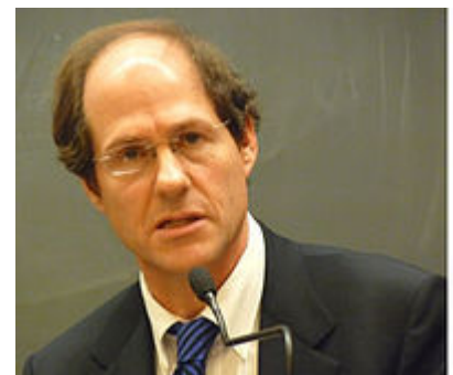
Cass Sunstein equated 9-11/Dissidence with "risks of violence".

In 2008, Cass Sunstein co-authored a paper entitled Conspiracy Theories , an effort to promote the pseudo-scientific study of what are referred to as " conspiracy theories " (a term launched by the CIA in 1968 to try to undermine criticism of the "lone nut" narrative of the JFK assassination [26] ). The abstract of Sunstein's paper mentioned that "A recent example is the belief, widespread in some parts of the world, that the attacks of 9/11 were carried out not by Al Qaeda, but by Israel or the United States. Those who subscribe to conspiracy theories may create serious risks, including risks of violence, and the existence of such theories raises significant challenges for policy and law." [27]