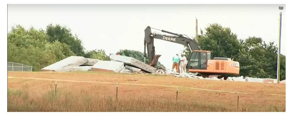
The remains of the Guidestones.