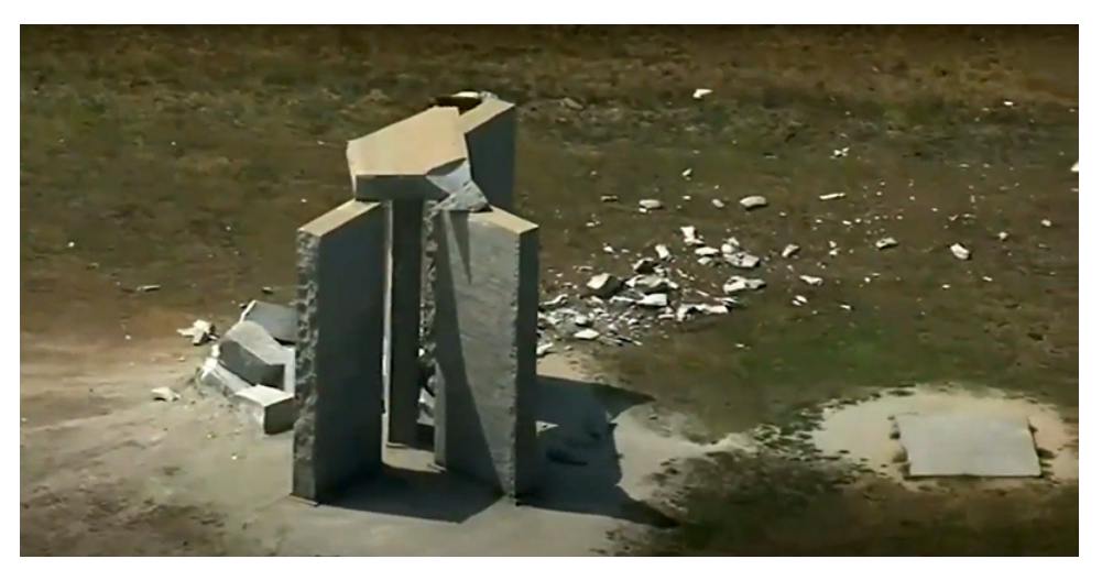
The Guidestones after the blast.

The blast reduced one of the slabs to rubble and severely damaged the capstone. After the detonation, a car was filmed leaving the scene. The Georgia Bureau of Investigation said in a statement that it is investigating the explosion together with the Elbert County Sheriff's Office.