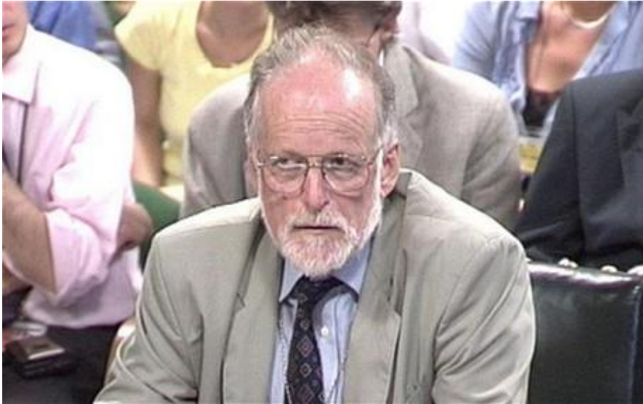
Dr David Kelly

Police have refused to comment on reports that a helicopter mysteriously landed at the scene of weapons expert Dr David Kelly's death shortly after his body was discovered.